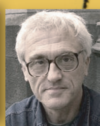
Jan T. Gross Professor of History, Princeton University