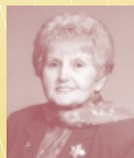
Eva Kor Survivor, Head of C.A.N.D.L.E.S. Purdue University